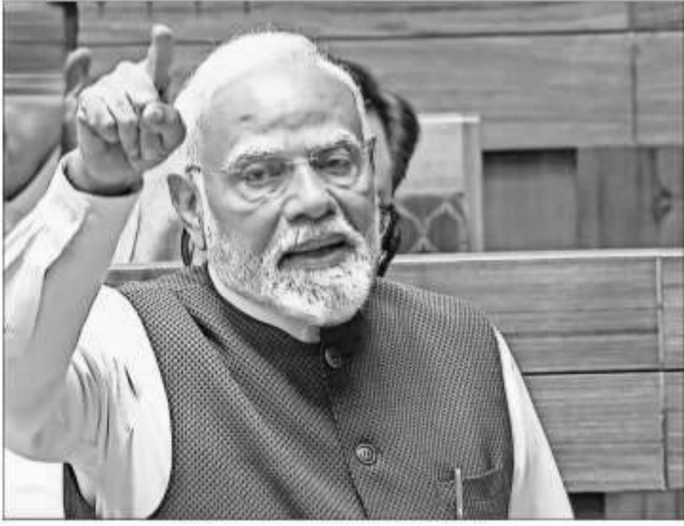
Prime Minister Narendra Modi replies to the motion of thanks to President's address in the Lok Sabha at the Budget session of Parliament on Tuesday

ATTACKING THE AAP and Congress on the eve of voting in Delhi by referring to Arvind Kejriwal's "Sheesh Mahal" and "Jacuzzi", Sonia Gandhi's "poor thing" remark about the President and Rahul Gandhi "fighting the Indian State", Prime Minister Narendra Modi Tuesday said his government had chosen the path of "sansthtikaran" (satisfaction) over "tushitkaran" (appesment) and "100 per cent saturation" of welfare schemes was "real social justice, secularism and respect for the Constitution".