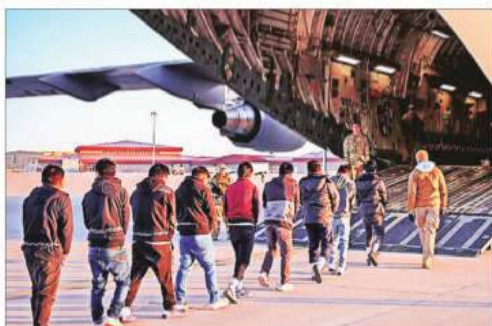
Migrants are mostly from Gujarat and Punjab, sources said

This is the first batch of illegal immigrants from India to be deported since Trump's return to office.