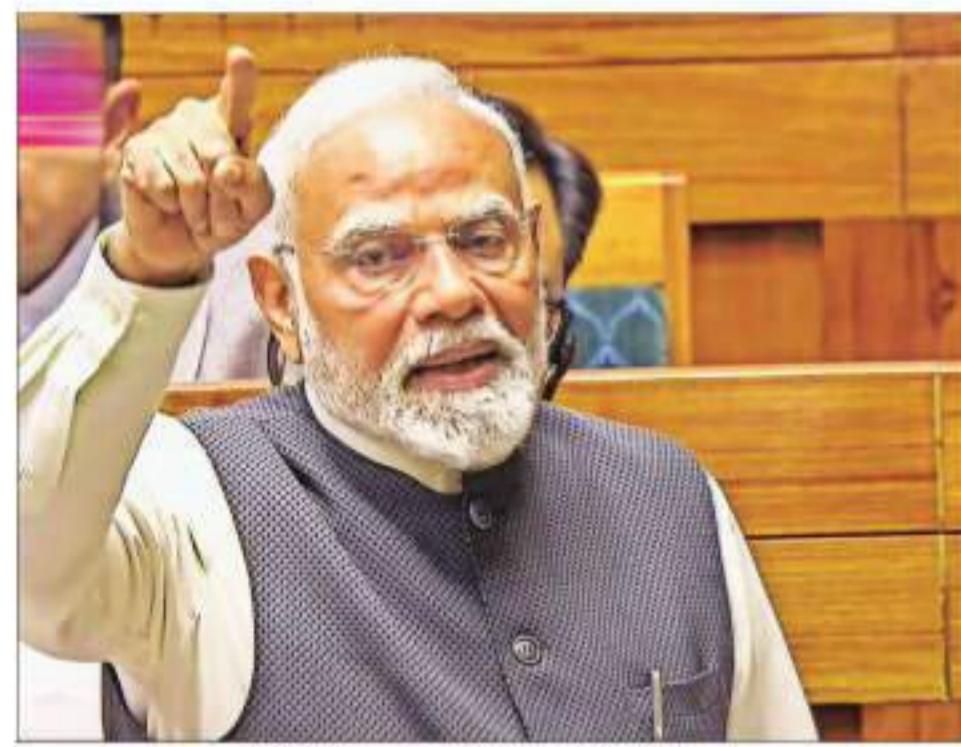
Prime Minister Narendra Modi replies to the motion of thanks to President's address in the Lok Sabha at the Budget session of Parliament on Tuesday