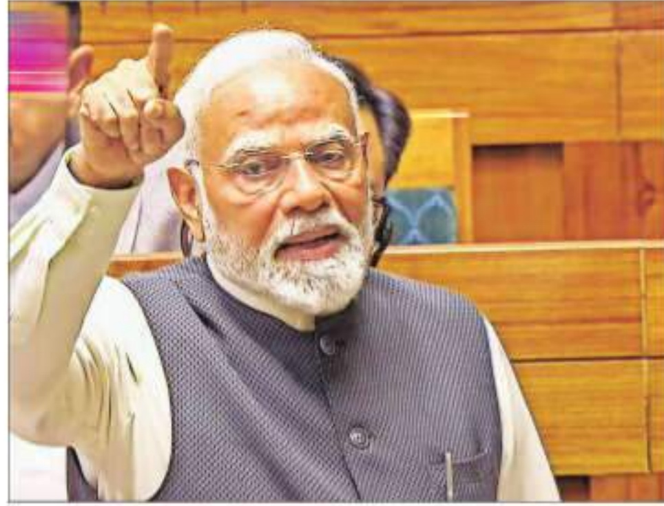
Prime Minister Narendra Modi replies to the motion of thanks to President's address in the Lok Sabha at the Budget session of Parliament on Tuesday

ATTACKING THE AAP and Congress on the eve of voting in Delhi by referring to Arvind Kejriwal's 'Sheesh Mahal' and 'jacuzzi', Sonia Gandhi's 'poor thing' remark about the President and Rahul Gandhi 'fighting the Indian State', Prime Minister Narendra Modi Tuesday said his government had chosen the path of 'santushtikaran' (satisfaction) over 'tusthikaran' (appeasement) and '100 per cent saturation' of welfare schemes was 'real social justice, secularism and respect for the Constitution'.