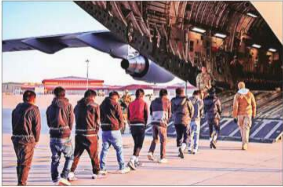
Migrants are mostly from Gujarat and Punjab, sources said

Last year, about 1,100 illegal immigrants were deported to India through special planes.