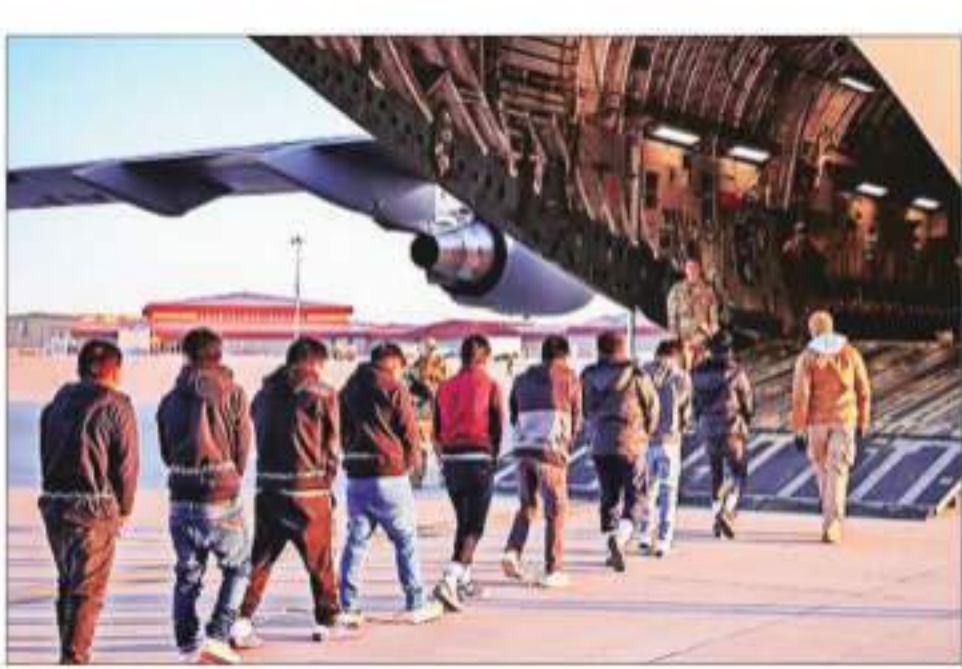
Migrants are mostly from Gujarat and Punjab, sources said

This is the first batch of illegal immigrants from India to be deported since Trump's return to office.