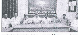
ಸಂಜೆವಾಣಿ ಪಾಠ್ಯ ಪುಸ್ತಕ ಸಂಪಾದಕರ ಪ್ರಶಸ್ತಿ ಪ್ರದಾನ.