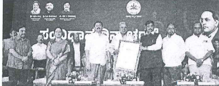
ನಗರದ ಅಂತರಜಾಲ ಭವನದಲ್ಲಿ ನಡೆದ ಸಂದಿಧಾನ ದಿನಾಚರಣೆ ಕಾರ್ಯಕ್ರಮದಲ್ಲಿ ಸಮಿತಿ ಸದಸ್ಯರಾದ...

ಅಕ್ರಮ ನಾಡ ಬಂದೂಕು ತಯಾರಿಕೆ ಜಾಲ ಪತ್ತೆ. 6 ಮಂದಿ ಸೆರೆ.