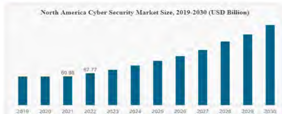
Figure 1: North America Security Market Size