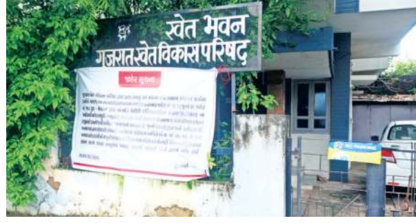
A banner has been placed at the entrance of Khet Bhavan stating the building has been gifted to MGSAMT. Express