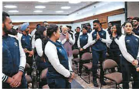
Prime Minister Narendra Modi interacts with Indian athletes who are going to represent the country in the upcoming Paris Olympics

By PRESS TRUST OF INDIA, New Delhi, 5 July