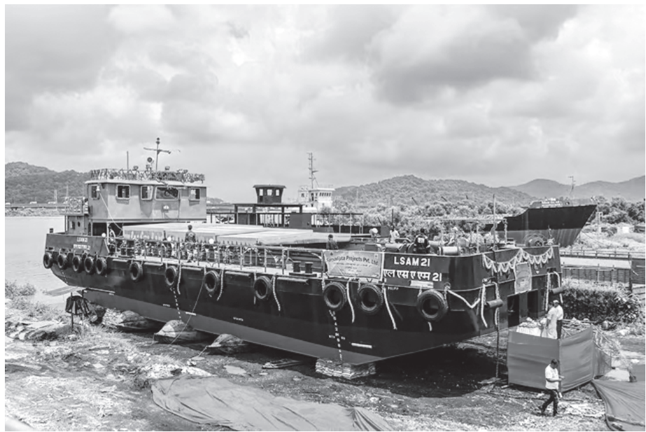
'Ammunition Cum Torpedo Cum Missile Barge, LSAM 21 (Yard 131)', 7th Barge of 11 x ACTCM Barge Project, built by MSME Shipyard, M/s Suryadipta Projects Pvt Ltd, Thane for Indian Navy during its launch.