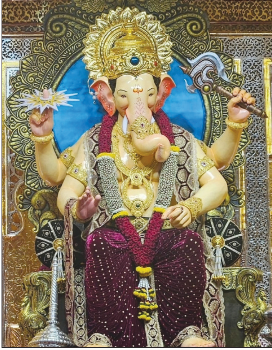
Mumbai's Lalbaugcha Raja was unveiled ahead of Ganesh Chaturthi.

In his greeting message, the Chief Minister said that the arrival of Lord Ganesha every year brings a new energy, inspiration and enthusiasm. This creates an auspicious, holy atmosphere. Ganeshotsav shows the culture of Maharashtra. Therefore, the world is also paying attention to Maharashtra. Shri Ganesha is considered Kaladhipati." Therefore, during this festival, creativity also flourishes. Every corner of Maharashtra overflows with such innovations and enthusiasm. Let us celebrate this festival with enthusiasm, joy and sanctity this year too," he said. "While serving Lord Ganesha with spirit, let us be conscious of social responsibility. Taking the festival as an opportunity, let us reach out to the needy in the society and try to provide them with education, health and various types of services and help," he noted.