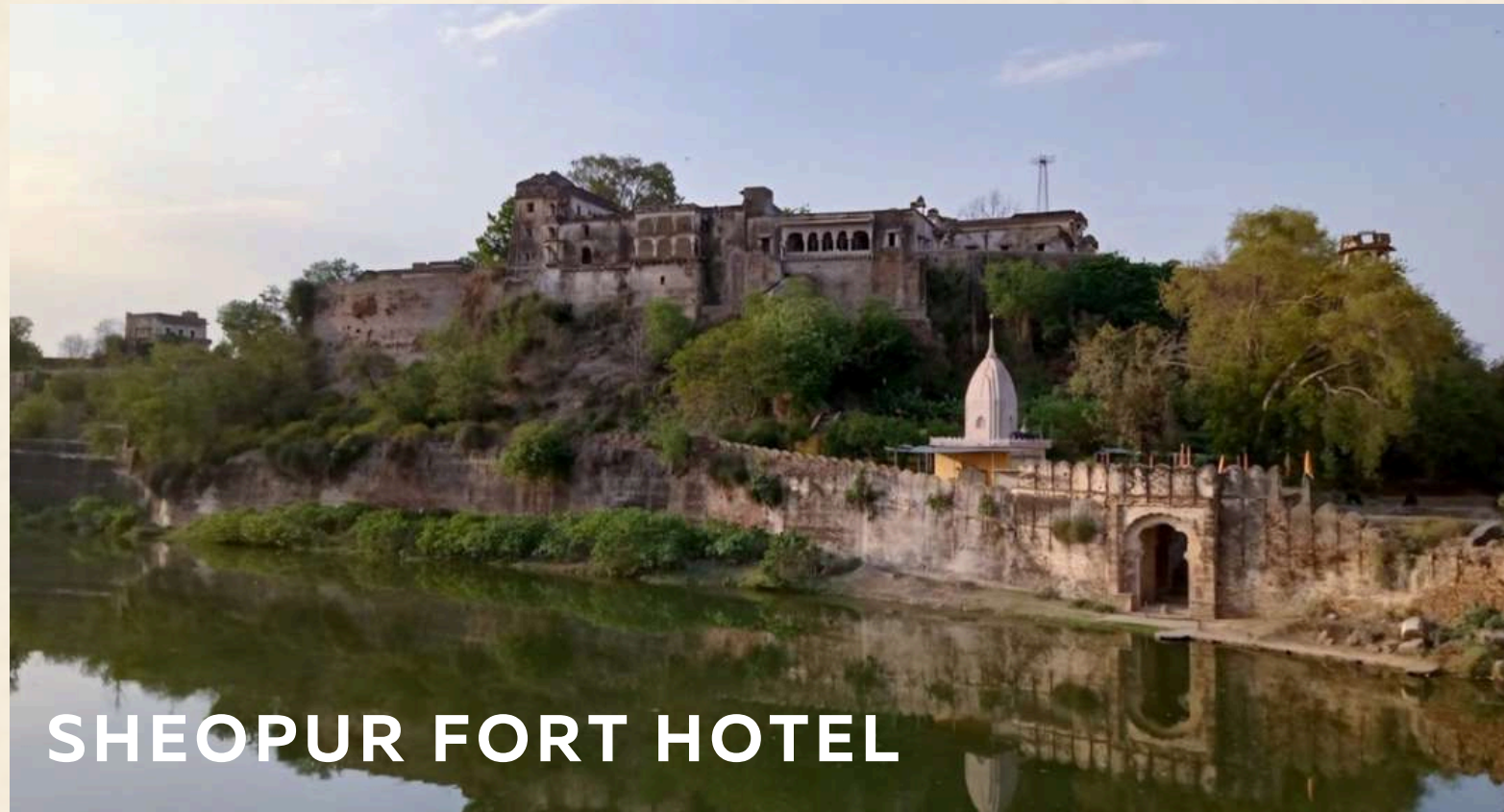
SHEOPUR FORT HOTEL