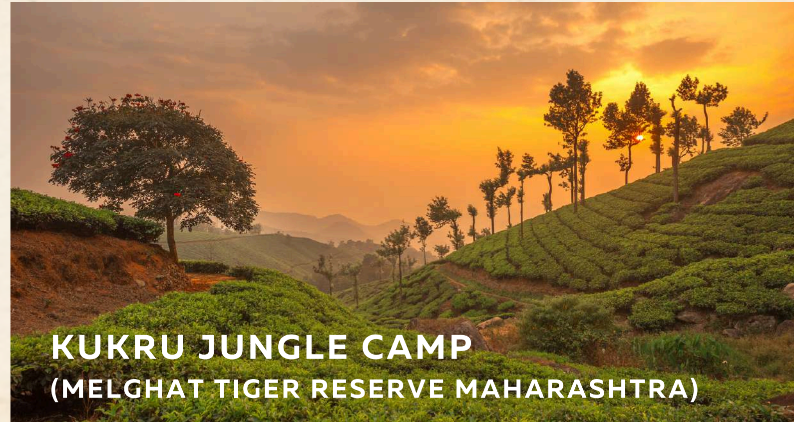
KUKRU JUNGLE CAMP (MELGHAT TIGER RESERVE MAHARASHTRA)