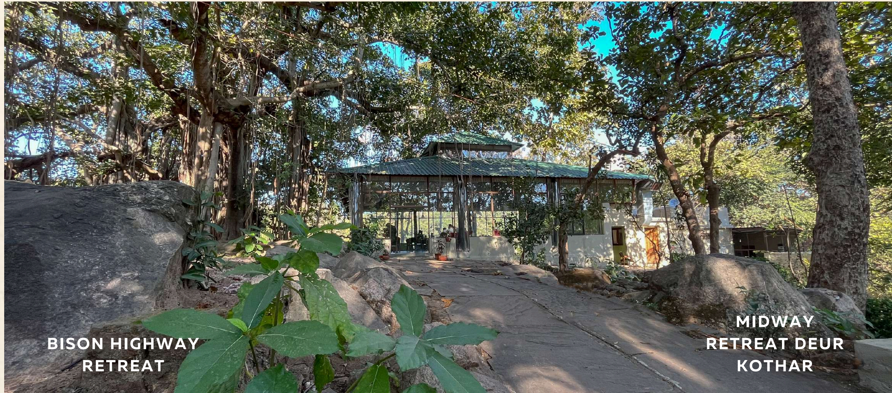
BISON HIGHWAY RETREAT

In addition to the four boutique luxury wildlife resorts, our company also operates two highway restaurants and motels