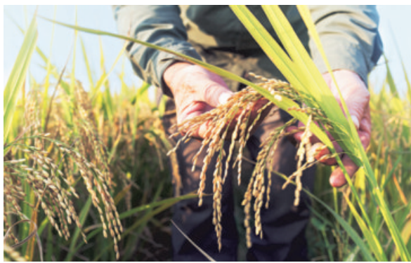
The crop damage could lead to food inflation, but the rains may also result in higher soil moisture

Monsoon rains are likely to be prolonged into late September this year due to the development of a low-pressure system in the middle of the month, two weather department officials told Reuters. Above-normal rainfall due to the delayed withdrawal of the monsoon could damage the country's summer-sown crops like rice, cotton, soybean, corn, and pulses, which are typically harvested from mid-September. The crop damage could lead to food inflation, but the rains may also result in higher soil moisture, benefitting the planting of winter-sown crops such as wheat, rapeseed, and chickpea. "There is an increased probability of a low-