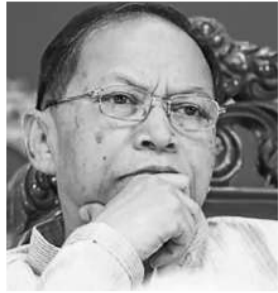
Bangladesh's ex-Chief Justice SK Sinha and ousted PM Sheikh Hasina

Bangladesh's former Chief Justice Surendra Kumar Sinha who was allegedly forced to leave the country about seven years ago while he was in office, has said he is ready to return to Bangladesh and prove that all the cases filed against him are false and fabricated if the government ensures his security. "I will go back to Bangladesh. I'm now waiting for a green signal," he told The Daily Star from abroad via video call on August 14, according to an agency report.