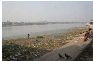
25 untapped drains discharge untreated sewage into the Ganga.

Several Dalit women sat on dharna in front of a temple in Odisha's Kendrapara district on Saturday after they were allegedly denied to perform the ritual of offering milk to the deity in the holy month of Kartik, police said. The women accused the temple priests and a group of upper caste people of not allowing them to perform the religious ritual at the Siddheswar Ramachandri Shakti shrine at Garajanga village under Marsaghai block of the district. The protesters lodged a complaint with Maharashtra police station on Saturday demanding action against those who stopped them from offering milk to the deity. "We have received a complaint in this connection. Attempts are being made to amicably settle the issue. Talks are with senior members both from the upper caste and dalits. Police are closely monitoring the situation with deployment in the village to thwart any possible breach of peace. The situation is, however, under control as of now," Inspector-In-Charge of Marsaghai police station, Purna Chandra Pattay said. PTI