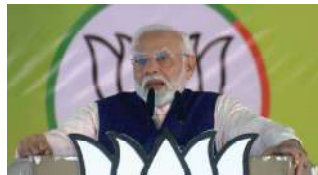
Congress is in efforts to divide people on caste lines and deprive them of reservation were made by leaders from Jawaharlal Nehru to Rajiv Gandhi, PM Modi said.

Prime Minister Narendra Modi on Saturday claimed that Congress hates OBCs as it cannot come to terms with the fact that a person from Backward Classes is at the helm of the country. Division among dalits, adivasis and backward classes suits Congress' politics, but due to their unity it is losing its support base, he said, speaking at a campaign rally here for the November 20 Maharashtra assembly elections and Nanded Lok Sabha by-poll. "It suits the Congress' politics if Dalits, Adivasis and Backward Classes are divided. Its game plan is to divide you into different groups and communities," he said. "Congress hates OBCs because it cannot divide the fact that an OBC is the prime minister for ten years and working by taking everyone along," Modi said.