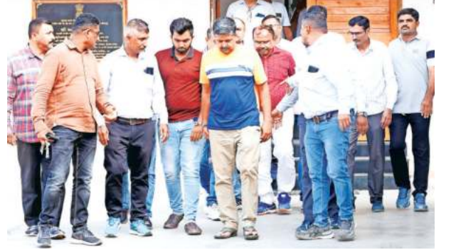
Accused RMC officials in Rajkot Crime Branch custody on Friday.