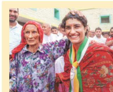
Congress candidate Vinesh Phogat (right) campaigns in Jind, Haryana, on Monday