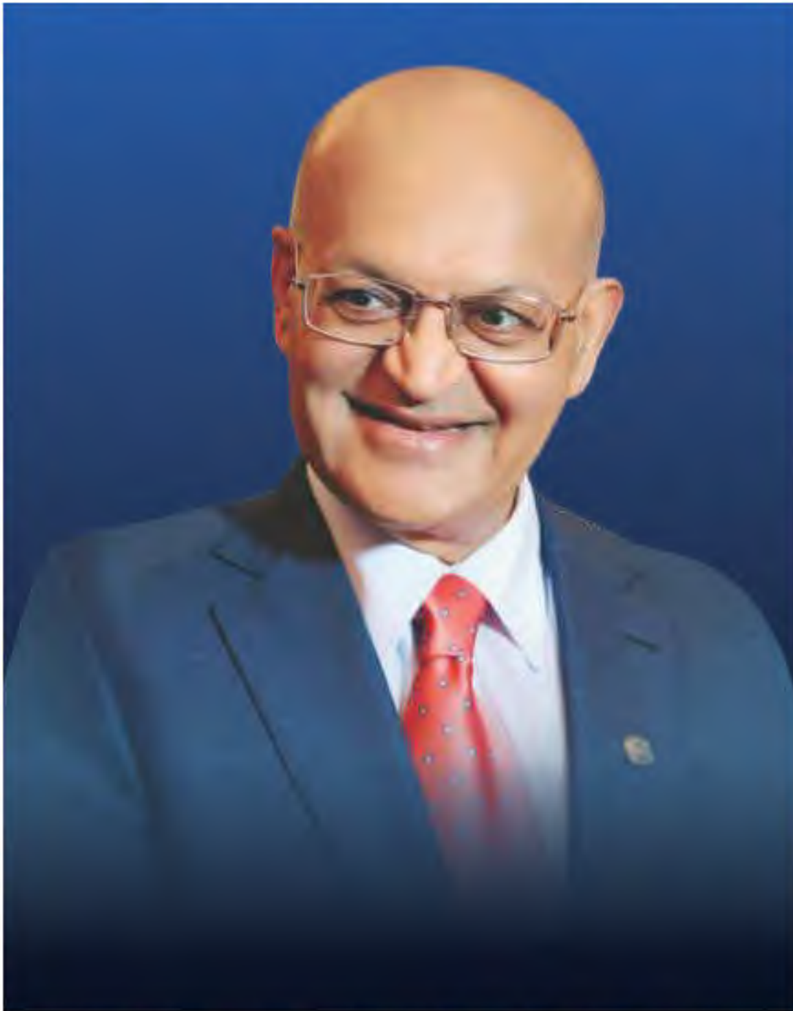
Hon'ble Shri Abhey Kumar Oswal