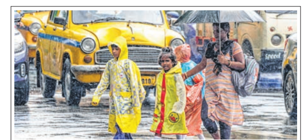
People amid monsoon rain in Kolkata

Thirteen people were killed in rain-related incidents across Uttar Pradesh in a 24-hour period ending Monday evening, the relief department officials said. According to the relief department, from 6 pm on Sunday to 6 pm on Monday, 13 people were killed in rain-related incidents in the state. It included two each in Fatehpur, Mainpuri and Gonda and one each in Mathura, Jalaun, Shravasti, Mahoba, Pratapgarh, Varanasi and Muzaffar Nagar, it said. UP recorded an average of 1.5 mm rainfall in the 24-hour period. River Ghagra is flowing above the danger mark at Elgin Bridge, Ayodhya, Turtpar and Quano in Gonda.