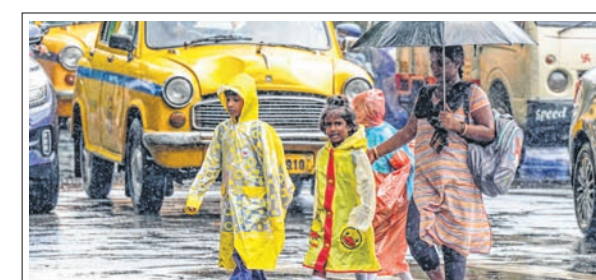
People amid monsoon rain in Kolkata

Thirteen people were killed in rain-related incidents across Uttar Pradesh in a 24-hour period ending Monday evening, the relief department officials said. According to the relief department, from 6 pm on Sunday to 6 pm on Monday, 13 people were killed in rain-related incidents in the state. It included two each in Fatehpur, Mainpuri and Gonda and one each in Mathura, Jalaun, Shravasti, Mahoba, Pratapgarh, Varanasi and Muzaffar Nagar, it said. UP recorded an average of 1.5 mm rainfall in the 24-hour period. River Ghagra is flowing above the danger mark at Elgin Bridge, Ayodhya, Turtpar and Quano in Gonda.