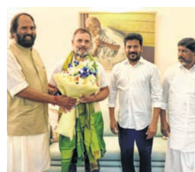
Revanth Reddy along with Deputy CM Bhatti Vikramarka meets Rahul Gandhi in New Delhi

Karnataka Minister for Labour, Santhosh Lad, stated on Monday that the government is under pressure from the IT industry to bring forth new legislation proposing extra hours of work for techies, but is evaluating the matter. He clarified while speaking to reporters at Vidhana Soudha that the government is still evaluating the Bill that would allow software professionals to work for 14 hours a day.