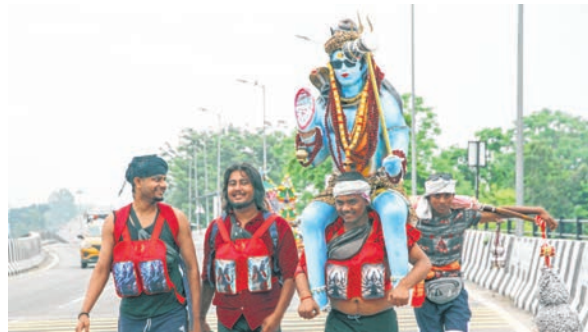
Kanwariyas carry an idol of Lord Shiva during Kanwar Yatra on first Monday of Sawan month in Haridwar

Congress MP Karti Chidambaram said the directive given by Uttar Pradesh and Uttarakhand governments was similar to the Nazi regime ordering Jews to display the