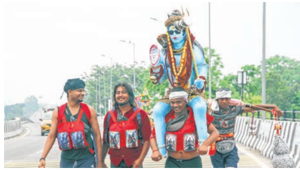
Kanwariyas carry an idol of Lord Shiva during Kanwar Yatra on first Monday of Sawan month in Haridwar

Congress MP Karti Chidambaram said the directive given by Uttar Pradesh and Uttarakhand governments was similar to the Nazi regime ordering Jews to display the