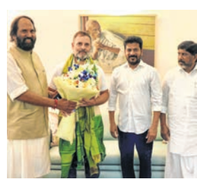
Revanth Reddy along with Deputy CM Bhatti Vikramarka meets Rahul Gandhi in New Delhi

Karnataka Minister for Labour, Santhosh Lad, stated on Monday that the government is under pressure from the IT industry to bring forth new legislation proposing extra hours of work for techies, but is evaluating the matter. He clarified while speaking to reporters at Vidhana Soudha that the government is still evaluating the Bill that would allow software professionals to work for 14 hours a day.