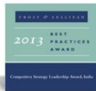
FROST & SULLIVAN Best Practices-2013