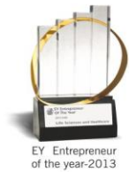
EY Entrepreneur of the year-2013