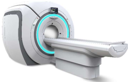
MICA– Whole Body 1.5T MRI