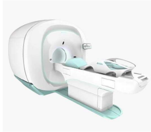
Quin– Whole Body 1.5T MRI

As a proud Make in India initiative, Time Medical is the first company in India to manufacture MRI systems that meet international safety and performance standards. The EMMA and PICA MRI models, which are FDA and CE approved , have undergone stringent clinical evaluations and are compliant with the highest international regulatory standards. This milestone reinforces India's capability to produce world-class medical devices, contributing to the country's growing healthcare infrastructure.