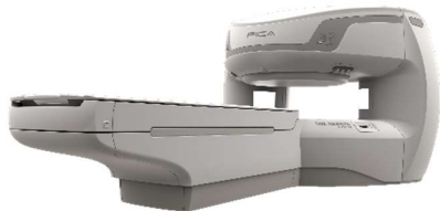
PICA Machine – Open body low-res 0.35T MRI