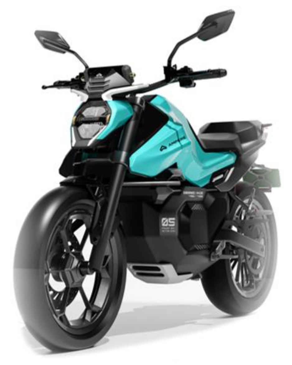
16Mn Motorcycles TIV in FY30. What if we get more thrill without fuel costs?