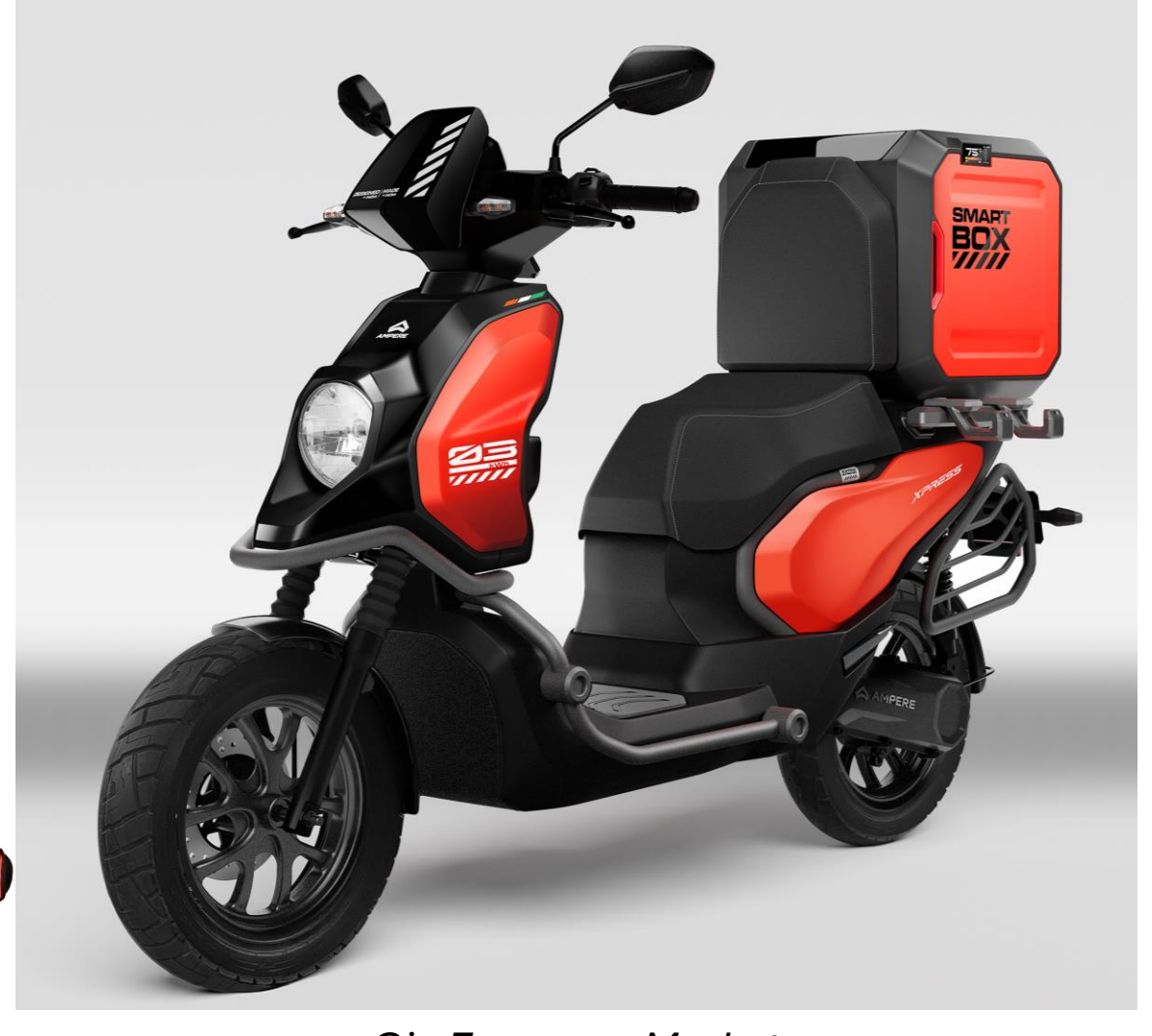
Gig Economy Market Projected at 23.5Mn by FY30