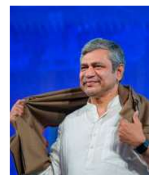
Ashwini Vaishnaw, Minister for Information and Broadcasting

The Information & Broadcasting Ministry has decided to ease norms of self-declaration certificate (SDC) for advertisers in a big relief for the advertisers.