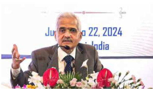
ON GUARD. RBI Governor Shaktikanta Das says fraudsters, sometimes, can use idle accounts for receiving and transferring large funds without the knowledge of account holders

The issue of persisting gap between credit and deposit growth was discussed at the meeting held with the top executives of banks. This was underscored by the fact that credit growth (at 18.85 per cent year-on-year) of all scheduled banks' as on June 14, 2024, outstripped de-