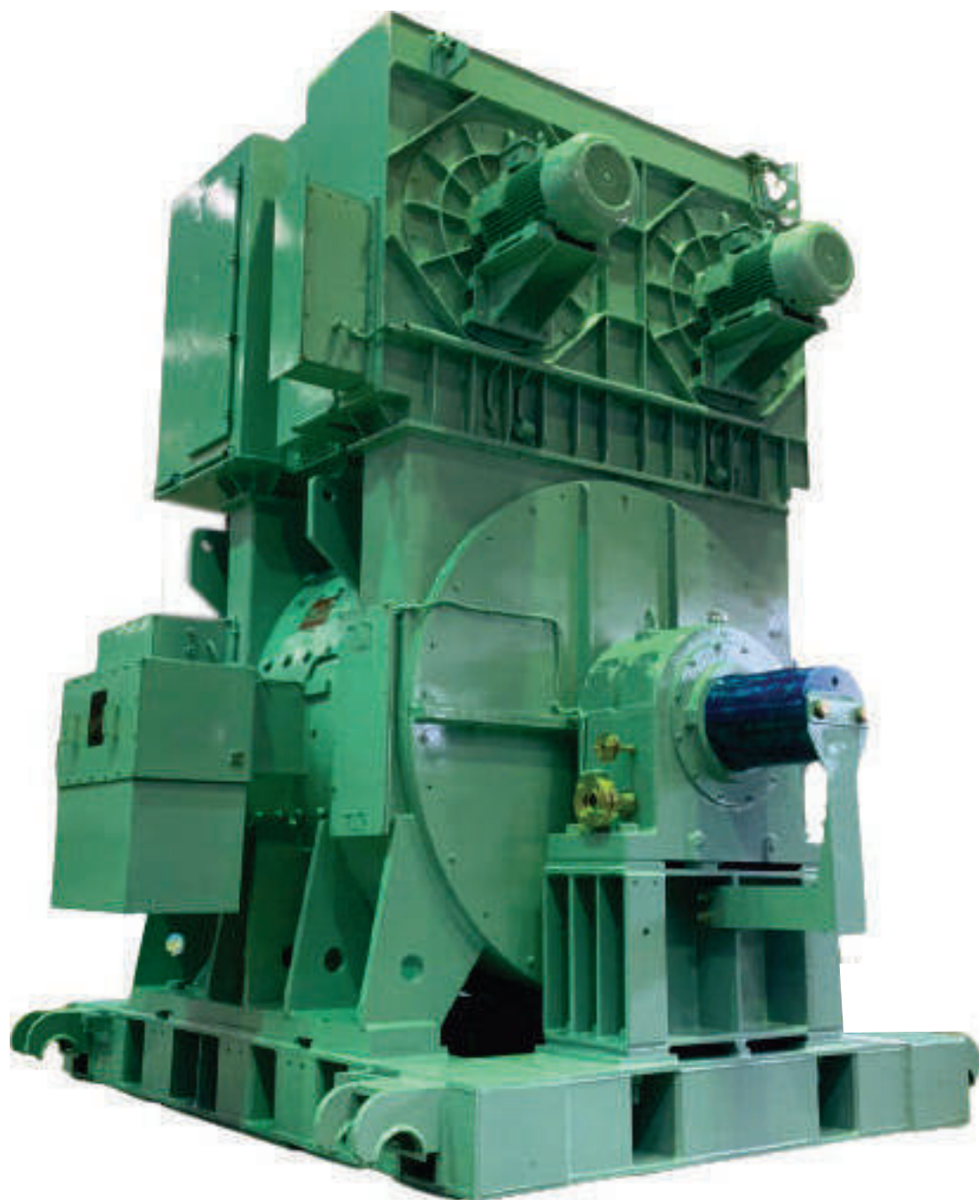
1950kw DC Motor, 880/990RPM, IP55/W7A86 in FRAME KWDC 3157