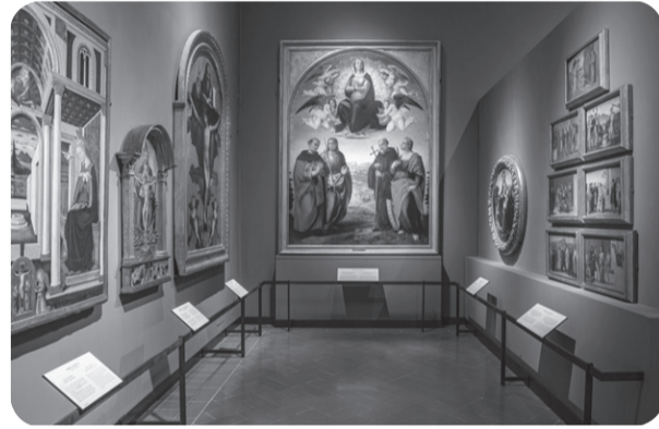
SALA DEL COLOSSO

required the efforts of forty men. It was transported half a mile from Michelangelo's workshop behind the Santa Maria del Fiore Cathedral to Piazza della Signoria. Michelangelo continued to work on the finer details; that summer, the sling and tree-stump support were gilded, and the figure was adorned with a gilded victory garland. Unfortunately, all gilded surfaces have been lost due to prolonged exposure to weathering elements.