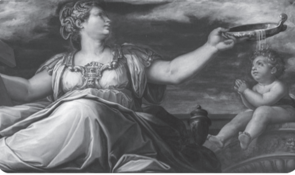
The venetian masterpiece by Giorgio Vasari.

required the efforts of forty men. It was transported half a mile from Michelangelo's workshop behind the Santa Maria del Fiore Cathedral to Piazza della Signoria. Michelangelo continued to work on the finer details; that summer, the sling and tree-stump support were gilded, and the figure was adorned with a gilded victory garland. Unfortunately, all gilded surfaces have been lost due to prolonged exposure to weathering elements.