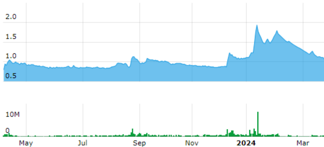
Stock Performance FY 2023-24

The performance of the Company's stock prices is given in the chart below: