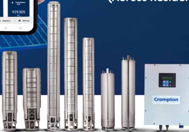
Range of Solar Pumps