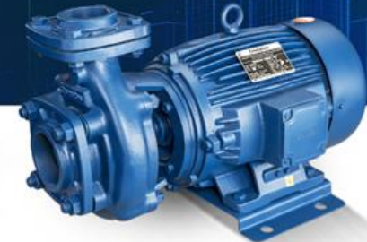
Agricultural Monobloc Pump