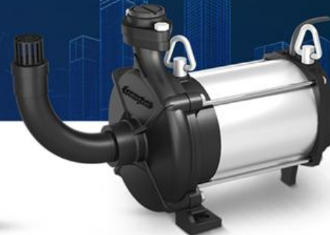
Residential Openwell Pump