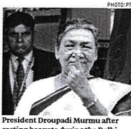
President Droupadi Murmu casting her vote during the Delhi assembly elections on Wednesday

Among the polls that predicted a BJP victory, the People's Pulse showed the saffron party was likely to get 51 to 60 seats, while the AAP may get 10-19 seats. According to People's Insight exit poll, the NDA is likely to get 40 to 44 seats, AAP 25