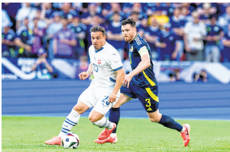
Switzerland's Xherdan Shaqiri in action against Scotland.

Scotland led from the 13th minute when Scott McTominay's shot took a wicked de-