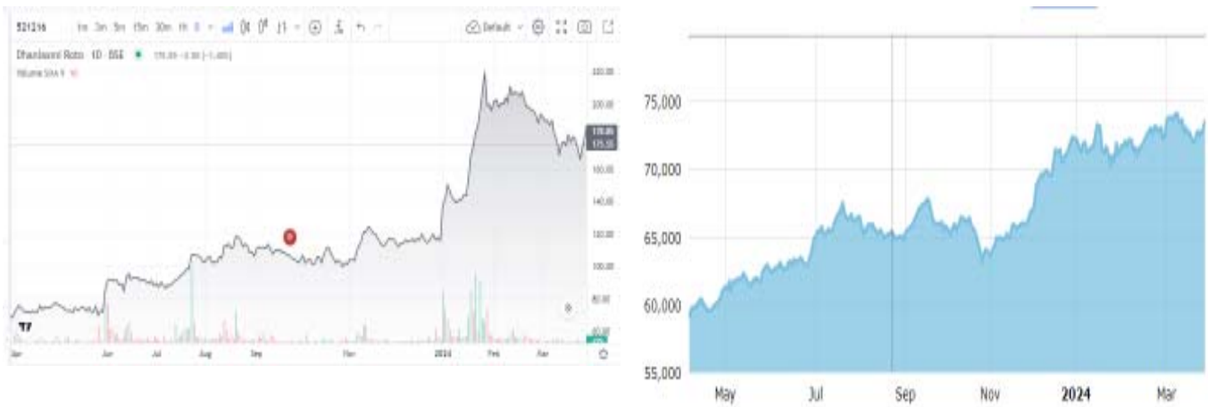
Dhanalaxmi Share Price