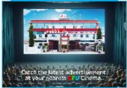
ADVERTISEMENT IN UFO CINEMA