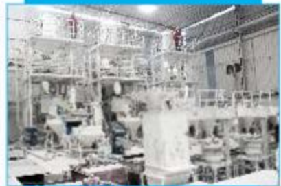
AUTOMIZED MATERIAL MIXING SETUP