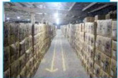
STOCK YARD 03