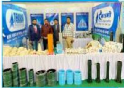
REGIONAL INDUSTRY CONCLAVE OF MP GOVT.