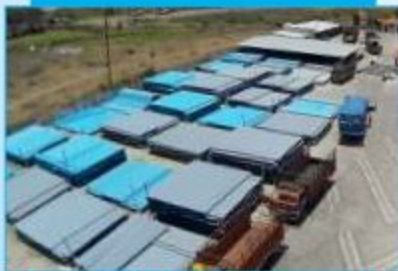
STOCK YARD 01