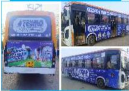
BRANDING LOCAL BUS TRANSPORTATION