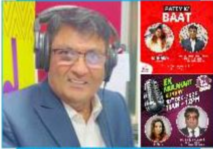
FM CAMPAIGN RED FM-93.50 & MY FM-94.3