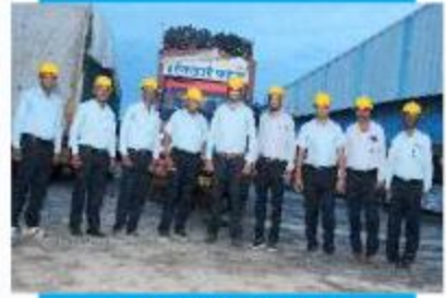
SKILLED TECHNICAL TEAM