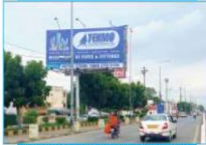
HOARDING BRANDING IN INDORE - BHOPAL - PUNE