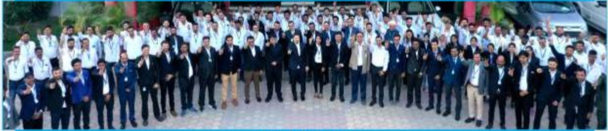
OUR TEXMO FAMILY