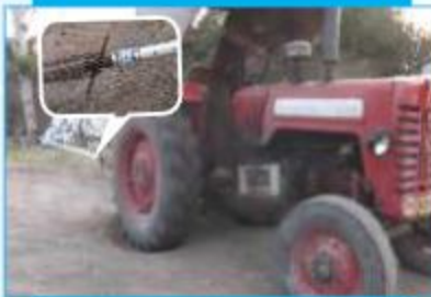
COLUMN PIPE STRENGTH TESTING