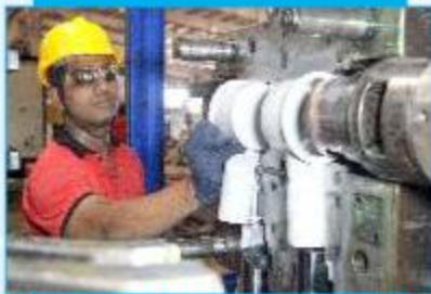
ONLINE PRODUCT CHECKING