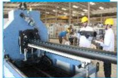
ONLINE QUALITY CHECKING