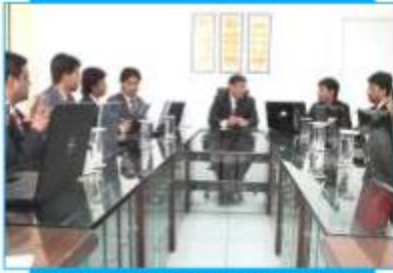
PROFESSIONAL MARKETING TEAM