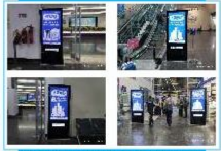
INDORE AIRPORT DIGITAL SCREENS ADVERTISEMENT