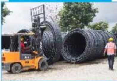
STOCK YARD 02