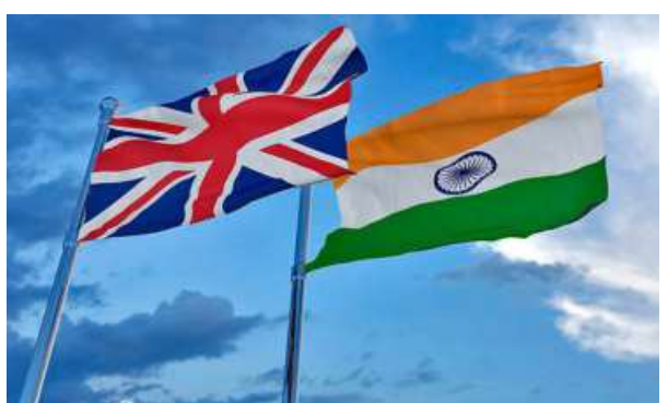
AT A CROSSROADS. The India-UK FTA talks aim to double bilateral trade to $100 billion by 2030

India, too, is strategising more on future FTAs, and an active exercise is underway