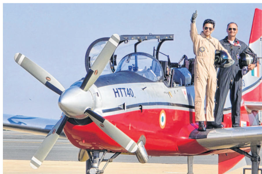
BJP MP Tejasvi Surya takes a sortie in HTT 40 aircraft during the Aero India 2025, in Bengaluru on Thursday

Today I had the opportunity to fly in HTT 40, produced by our own HAL. HAL is the pride of India. It is the pride of B'luru