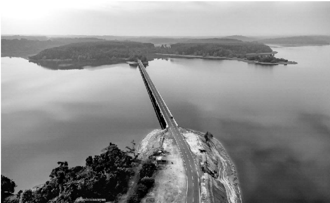
Construction of Bridge at Sagar Pattaguppa Road in Hosanagar Taluk in Shimoga District