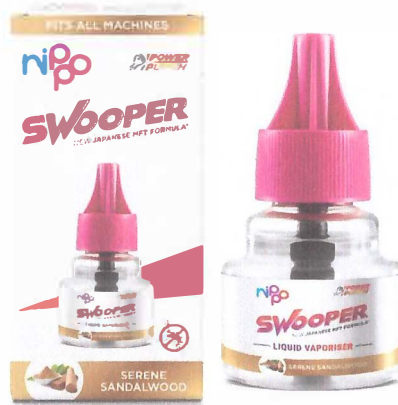
Refill Single Pack