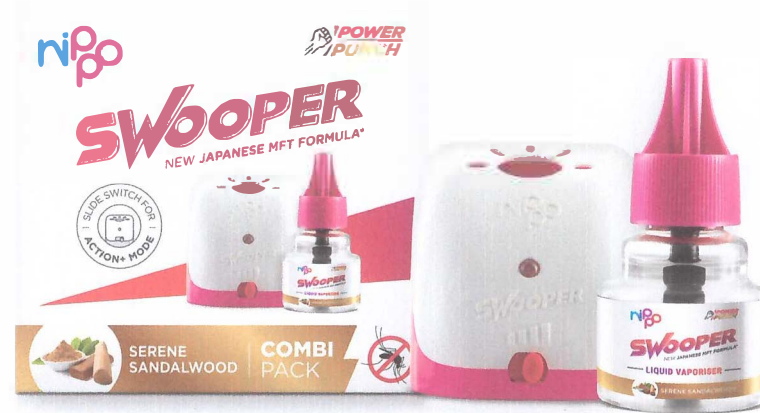
Combi Pack (1 Refill + 1 Machine)

NIPPO is already a strong player in the Home Care (Others) segment with Batteries & Mosquito Swatters.