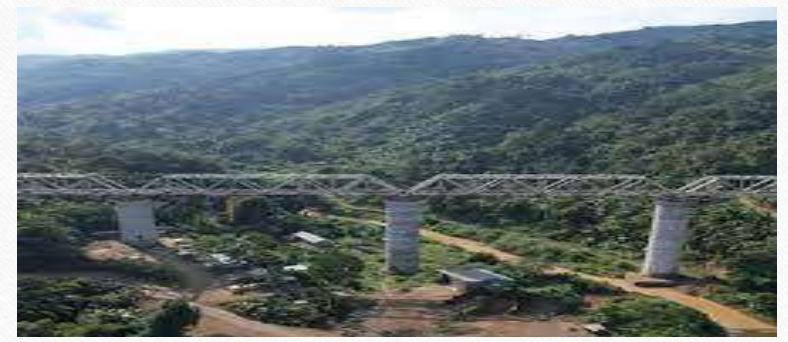
Construction of foundation and sub structure over pile foundation for Tall Bridge of new BG Railway line from Bairabi to Sairang (Mizoram).