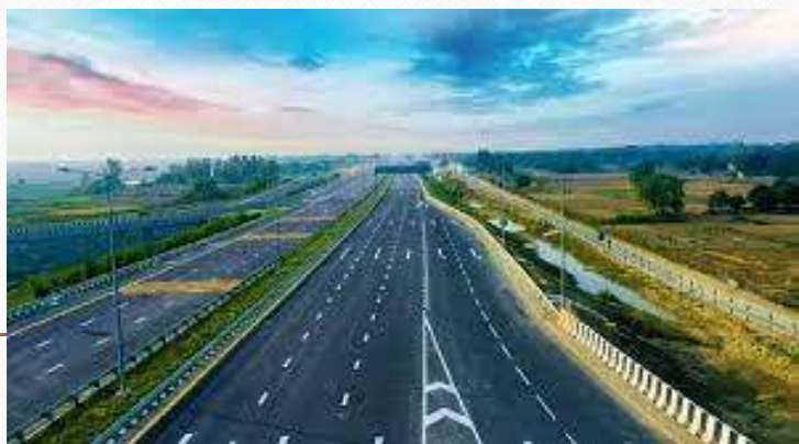
Maintenance of National Highways from Tihu to Puthimari section of NH-31 in the State of Assam.