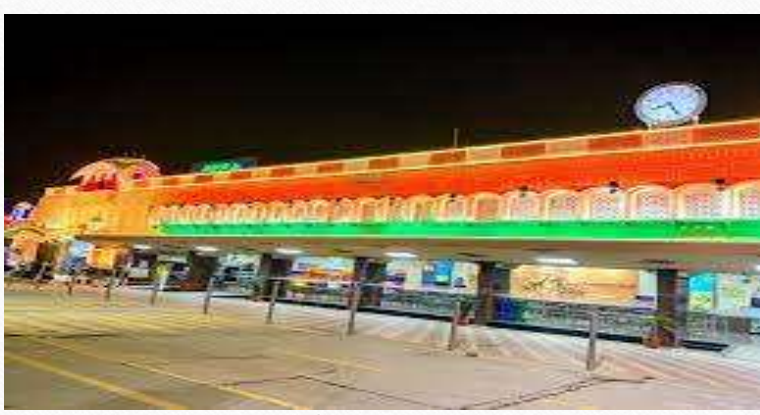
Major upgration of Gandhinagar (Jaipur) Railway Station of Jaipur Division of North Western Railway through EPC.