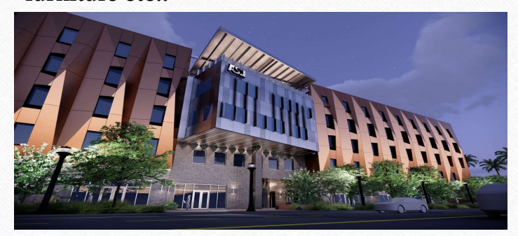
Detailed Design and Construction of ASU Campus and Facilities.