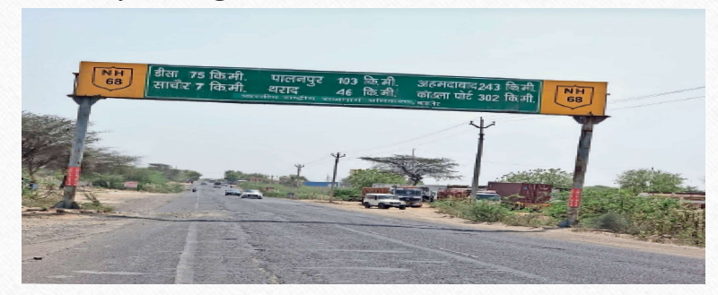
Short Term Improvement & Routine Maintenance of Two- Lane of NH-68 in the State of Rajasthan.