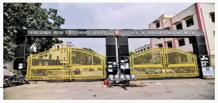
Construction of Medicine Block at JLN Hospital, Ajmer, Rajasthan.