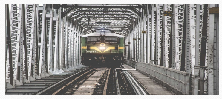
New BG Railway line project.