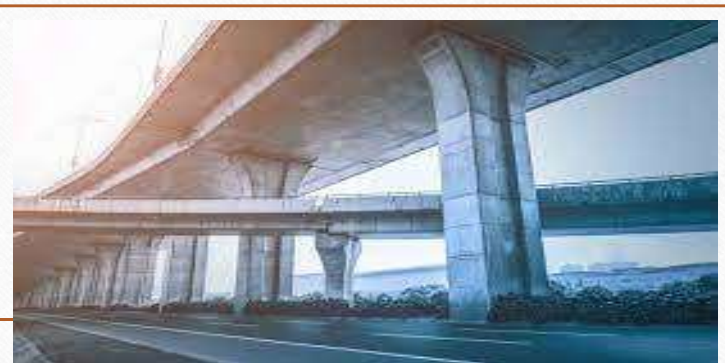
Maintenance of 3 lane Brahmaputra Bridge including their expansion joints & bearing, providing all necessary signboard, road furniture etc..