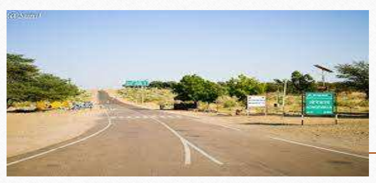
Operation & Maintenance Of Descoped Length Of 2 Lane With Paved Shoulder Tanot-Jaisalmer To Jaisalmer Bypass. In The State Of Rajasthan.