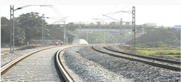
Construction of sub-structure and super-structure on pile foundation of major bridges in connection with double line work of New Bongagaon-Agthori doubling project.