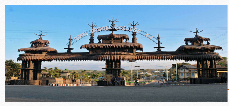
Construction Of Assam Hills Medical College & Research Institute, Diphu, Karbi Anglong.