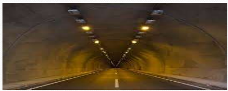
Construction of single line BG cut & cover tunnels from in between stations Kawnpui to Sairang including counterfort retaining wall on pile foundation & protection work along with all other ancillary works.