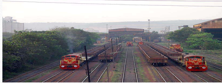
Boddavara- Sivalingapuram Stations of Kottavalasa-Koraput Doubling of Waltair Division in East Coast Railway