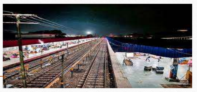
NBQ-GLPT-KYQ Doubling Project (Assam).