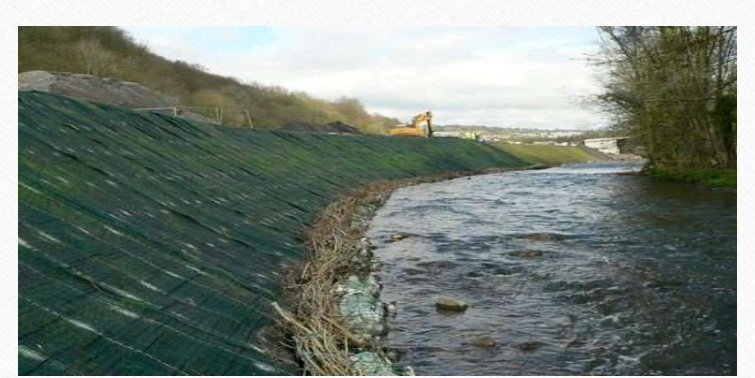
River Bank protection/erosion control measures on the left bank pf river Subansiri adjacent to village Gerki - 2 (RD 29 KM to - 30 KM)