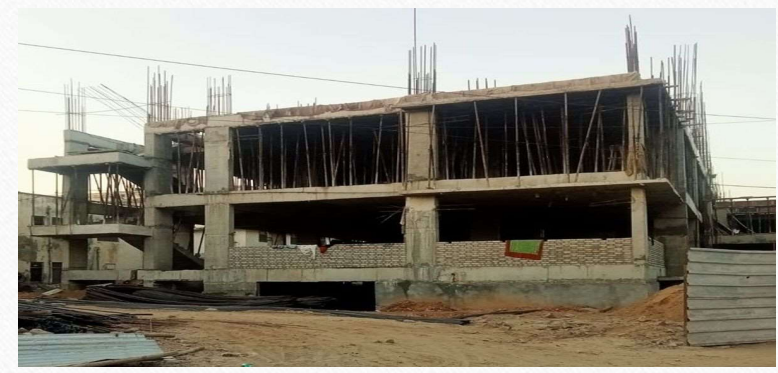
Construction of Pediatricks Block and multi level parking.