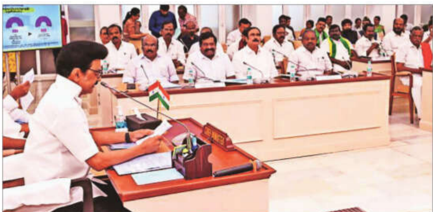
Tamil Nadu chief minister MK Stalin chairs the all-party meeting, in Chennai on Wednesday

The resolution read, "It is entirely unjustifiable to reduce parliamentary representation of Tamil Nadu and other south Indian states solely because they have proactively implemented