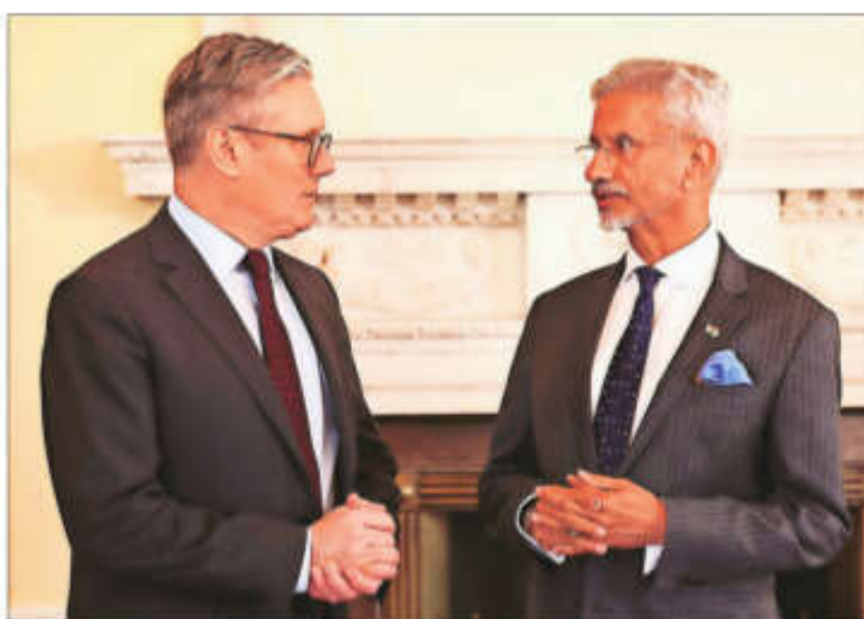
External affairs minister S Jaishankar (right) with British Prime Minister Keir Starmer

"Delighted to call on Prime Minister @Keir_Starmer at @10DowningStreet today. Conveyed the warm greetings of PM @narendramodi. Discussed taking forward our bilat-