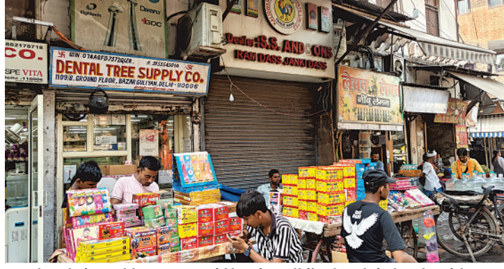
Crackers being sold on carts amid ban in Delhi's Chandni Chowk. With an AQI of 268 on Tuesday, city's air quality remained in the 'poor' category

Retailers report that business is better than last year. "Sales are up by