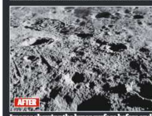
Images showing the lunar surface before and after the lander hop experiment.