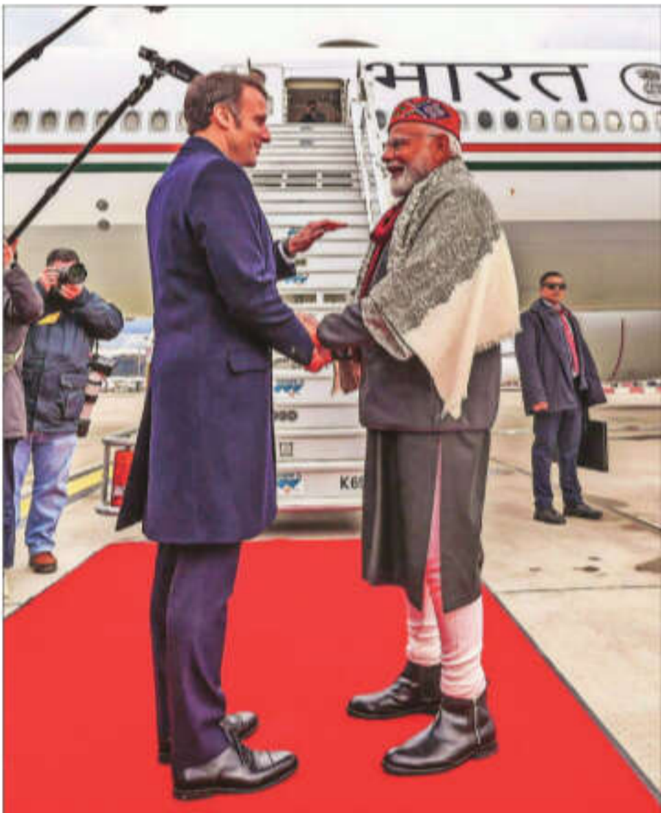
French President Emmanuel Macron accompanies Prime Minister Narendra Modi to the airport as he departs from Marseille, France, for Washington DC, USA, on Wednesday

Misri said AI was a "major area" of the discussion, he said. According to the joint statement, Modi and Macron stressed that nuclear energy is essential for bolstering energy security and transitioning towards a low-carbon economy.