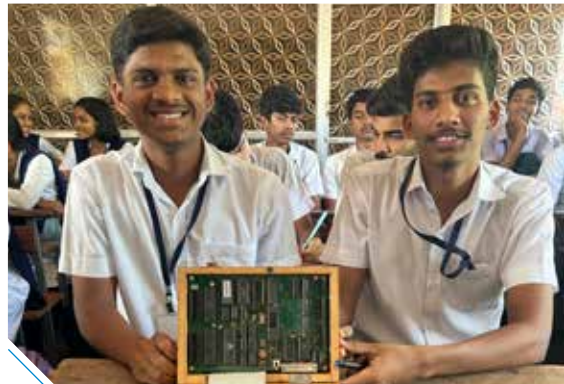
Engineering Kit for students.