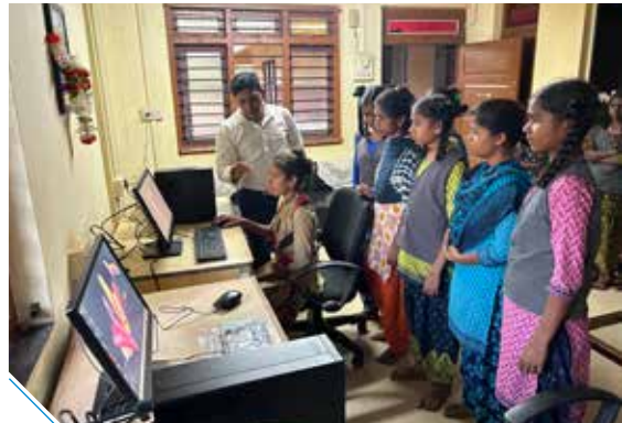
Providing an educational facilities to underprivileged girls students.