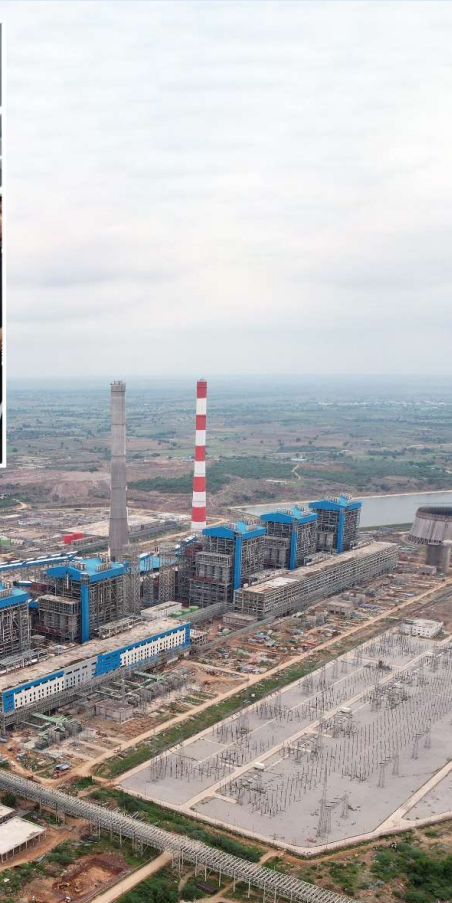
Hon'ble Chief Minister of Telangana inaugurating 800 MW Unit#2 of Yadadri Thermal Power Station