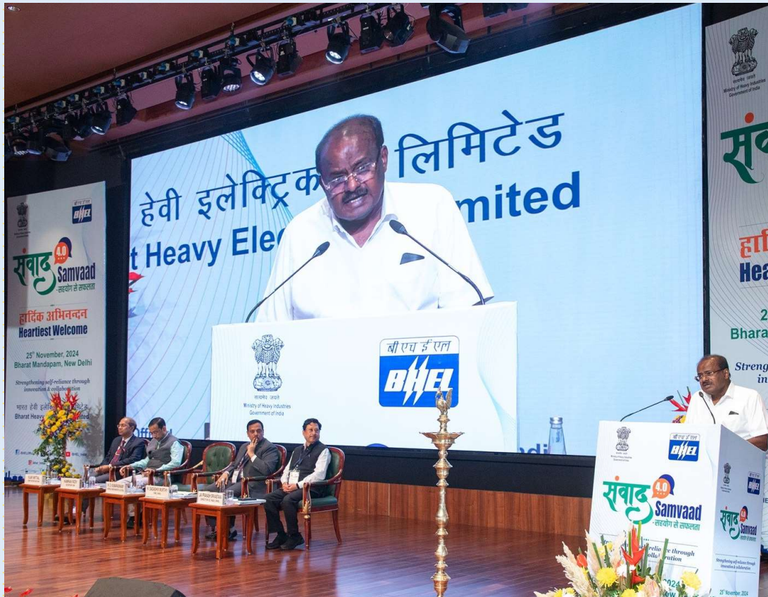
Hon'ble Union Minister of Heavy Industries and Steel, Shri H. D. Kumaraswamy inaugurating BHEL SAMVAAD 4.0