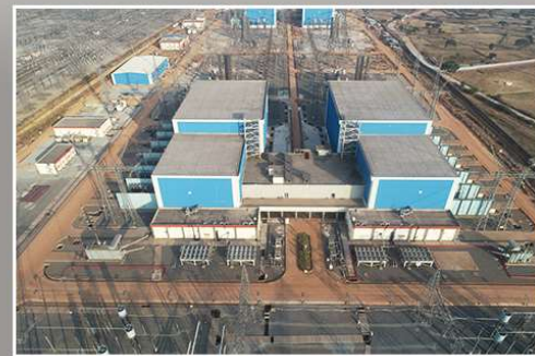
±800 kV, 6,000 MW Raigarh – Pugalur UHVDC link