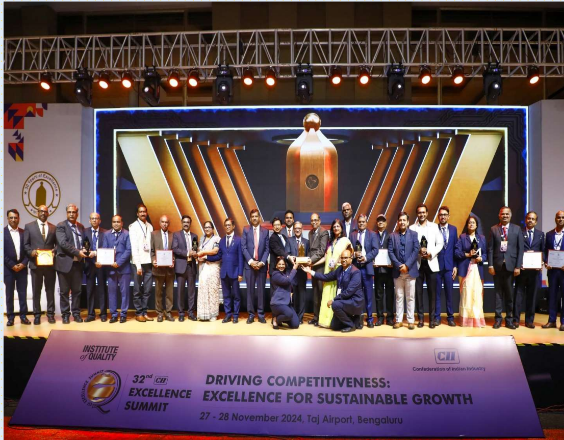
CII EXIM Bank Award for Business Excellence 2024