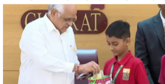
Gandhinagar, State Chief Minister Bhupendra Patel

today on September 5th Teacher's Day acknowledged the social responsibility of teachers and contributed to the Teachers' Welfare Fund. Children of St. Xavier's School and School of Achievers in Gandhinagar reached the Chief Minister's