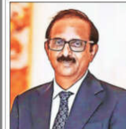
SBI chairman CS Setty

STATE BANK OF India (SBI) chairman C S Setty on Wednesday called for active participation of mutual funds and pension funds in the corporate bond market.