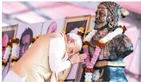
प्रधानमंत्री ने नाशिक में शिवाजी महाराज की प्रतिमा को नमन किया

प्रधानमंत्री नरेंद्र मोदी ने शुक्रवार को जोर देकर कहा कि दुनिया की कोई ताकत जम्मू-कश्मीर में अनुच्छेद 370 को वापस नहीं ला सकती। 'इंडिया' गठबंधन पर निशाना साधते हुए उन्होंने कहा कि कांग्रेस और उसके सहयोगी दलों को पाकिस्तान के एजेंडे को बढ़ावा नहीं देना चाहिए और अलगाववादियों की भाषा नहीं बोलनी चाहिए। प्रधानमंत्री ने महाराष्ट्र के धुले में एक रैली को संबोधित करते हुए आरोप लगाया कि कांग्रेस एक जाति को दूसरी जाति के खिलाफ खड़ा कर रही है। लोगों को एकजुट रहने के लिए आगाह करते हुए उन्होंने कहा, 'एक हैं, तो सेफ (सुरक्षित) हैं'। महाराष्ट्र में 20 नवंबर को होने वाले विधान सभा चुनाव के लिए अपनी पहली रैली को संबोधित करते हुए मोदी ने कहा कि दलितों