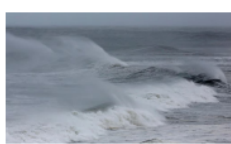
The Dutch team simulated 2,200 years of AMOC flow. The researchers added to the model expectations for future human-caused climate change. The results predicted "an abrupt AMOC collapse," after 1,750 years.

But the researchers noted it is difficult to provide a realistic date because the process could be influenced by many unknown circulation events. Making a prediction is also difficult because "current observational records are too short" to provide an exact estimation of collapse.