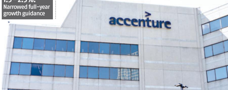
SHIVANI SHINDE Mumbai, 20 June

7,882: Headcount addition in the quarter, attrition at 14%