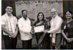
பள்ளியின் தலைவர் அமைப்பின் கல்விப் பரிவார்த்தனை குழுவும் லண்டன் குளாஸ்பாஸ் பள்ளியின் கல்விப் பரிவார்த்தனை குழுவும் சேர்ந்து... லண்டன் குளாஸ்பாஸ் பள்ளி அமைப்பின் கல்விப் பரிவார்த்தனை குழுவும் லண்டன் குளாஸ்பாஸ் பள்ளியின் கல்விப் பரிவார்த்தனை குழுவும் சேர்ந்து...