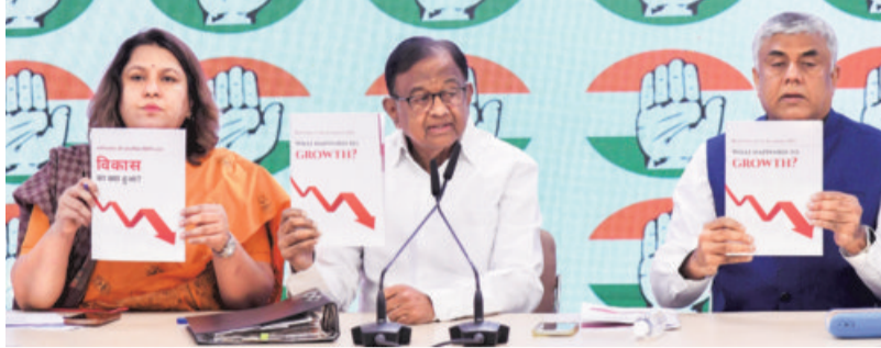
P Chidambaram (centre) and other Congress leaders release the report, which says the NDA gov't's policies will make India uncompetitive and underproductive

On the eve of the tabling of the Economic Survey for 2024-25 in Parliament, the Congress on Thursday released a report titled "Real State of the Economy", which blamed the National Democratic Alliance (NDA) government's economic policies for "marching India forward into the middle income trap, which will make India 'uncompetitive, underproductive and unequal'".