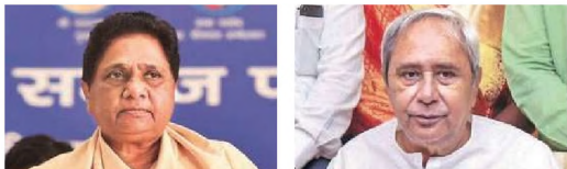
The BSP led by Mayawati (top) and Naveen Patnaik-led BJD were among the parties that could not win any seat in the 2024 Lok Sabha polls

In the assembly elections, BJD managed to win 51 of 147 seats with a 5 percentage points drop in its vote share to 40.22 per cent. This is its worst performance to date in both elections. BJD was among the