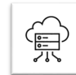
IoT, Cloud and Edge Computing