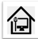
Multi-gigabit Fiber Broadband