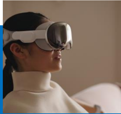
VR & Spatial Computing