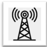
4G/5G Mobile Broadband

Key Enablers: Advancing Technologies and Expanding Connectivity