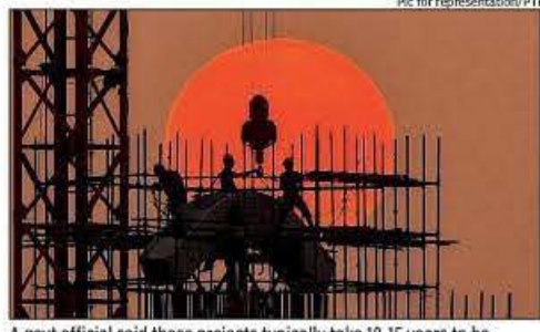
A full official said these projects typically take 10-15 years to be fully developed, but things will move quickly in several new cases