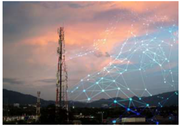
GROWING USERS. The number of telephone subscribers in India increased to 1,199.28 million at the end of March this year, registering a yearly growth of 2.3 per cent

The sector regulator, in its yearly report titled - "The Indian Telecom Services Yearly Performance Indicators 2023-2024" - also said that the adjusted gross revenue (AGR) increased to