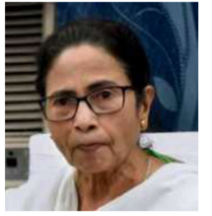
West Bengal Chief Minister Mamata Banerjee.

With the male-female voter count gap narrowing in West Bengal, women-centric schemes have gotten more prominence in the State Budget for the financial year 2025-26.