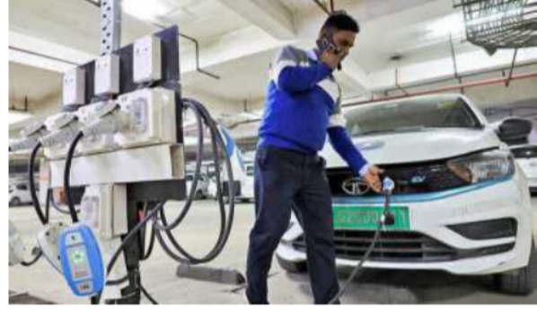
ELECTRIC PUSH. Karnataka ranks 3rd in India in EV adoption

The policy targets installing an additional 2,600