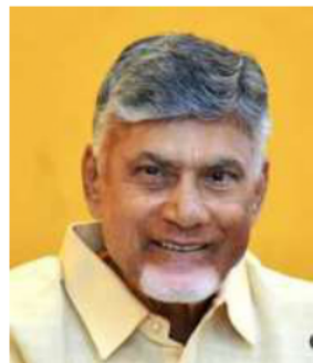
Chief Minister N Chandrababu Naidu

The Andhra Pradesh government has entered into separate Memoranda of Understanding (MoUs) for various tourism projects in the State in the last six months, involving a total investment of ₹1,217 crore.