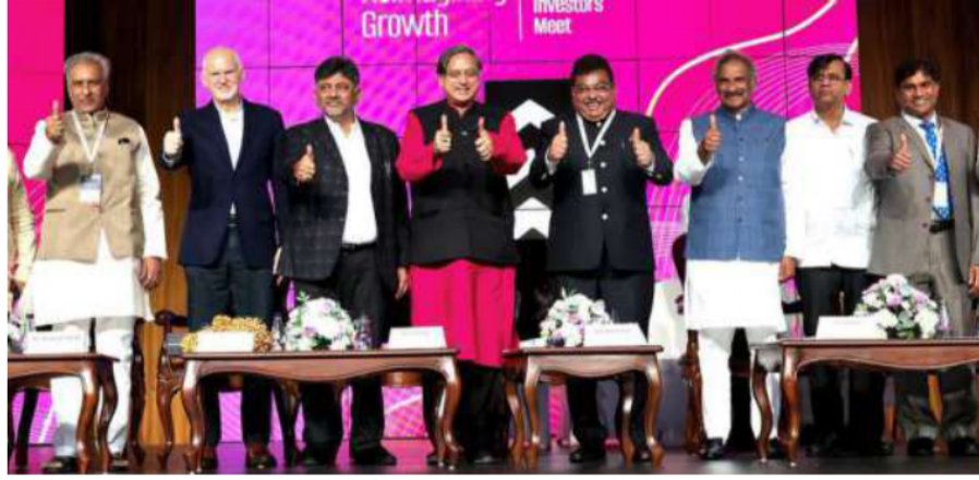
WOONG INVESTORS. George Papandreou, former Prime Minister of Greece; DK Shivakumar, Deputy CM of Karnataka; Shashi Tharoor, MP; MB Patil, Karnataka Minister for Large and Medium Scale Industries, and KJ George, Karnataka Energy Minister, with dignitaries at Invest Karnataka 2025

Key investment announcements during the event include ₹1.20 lakh crore from the JSW Group across renewable energy, cement, steel, and affiliated businesses; ₹54,000 crore from Baloda Steel & Power Ltd for an integrated steel plant; ₹36,000 crore from Mahindra Susten