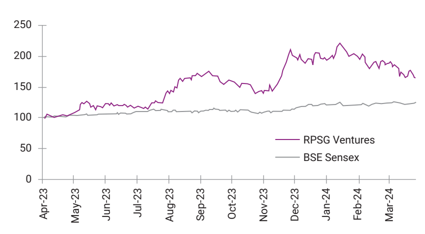
Chart A: RPSG Ventures Share Performance versus BSE Sensex

Note: Share price of RPSG Ventures and BSE Sensex have been indexed to 100 on 3 April 2023.