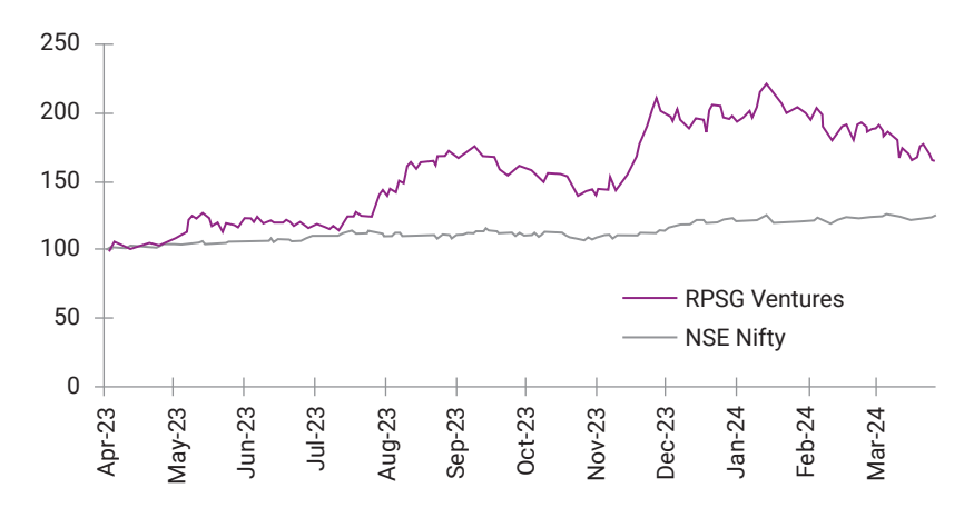
Chart B: RPSG Ventures Share Performance versus NSE NIFTY

Note: Share price of RPSG Ventures and NSE NIFTY have been indexed to 100 on 3 April 2023.